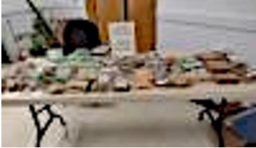
Baked Goods for sale at Sept. District Meeting