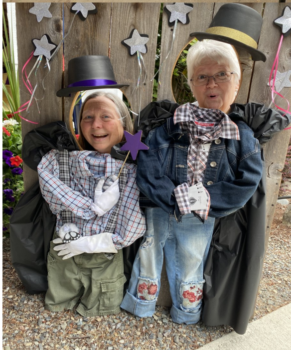
Country Gardeners ~ Pierce County Fair above Midland Clean Up to the left and below